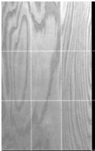
New 95% yield 5' x 8' Panel

That's 95 fewer panels to handle with a 16% improvement in yield.